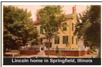
Lincoln home in Springfield, Illinois